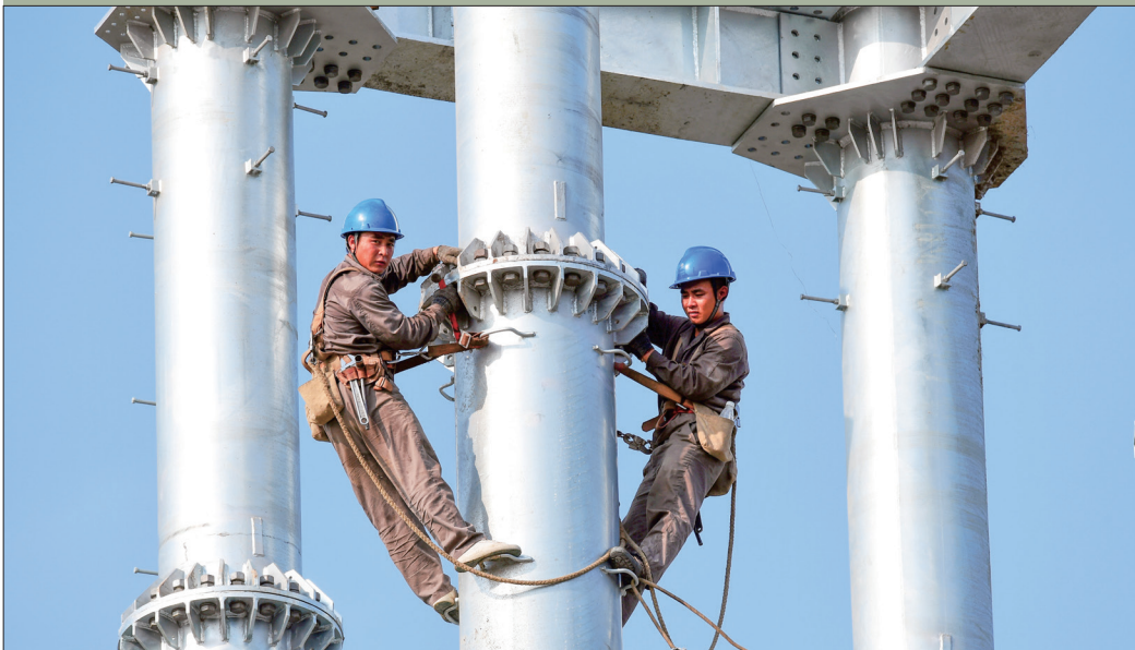
Workers assemble a tower foundation for a new power transmission line in Huangjing town, East China's Jiangsu Province on Tuesday. The line requires the building of 66 tower foundations, and it will ease power shortages in the town.